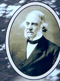
James Douglas, BC's first governor, attended services here

Built in 1861, Christ Church was at the centre of BC's early history