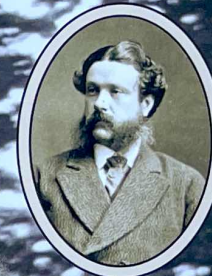
Edgar Dewdney was married here in 1864, after building his famous gold rush trail