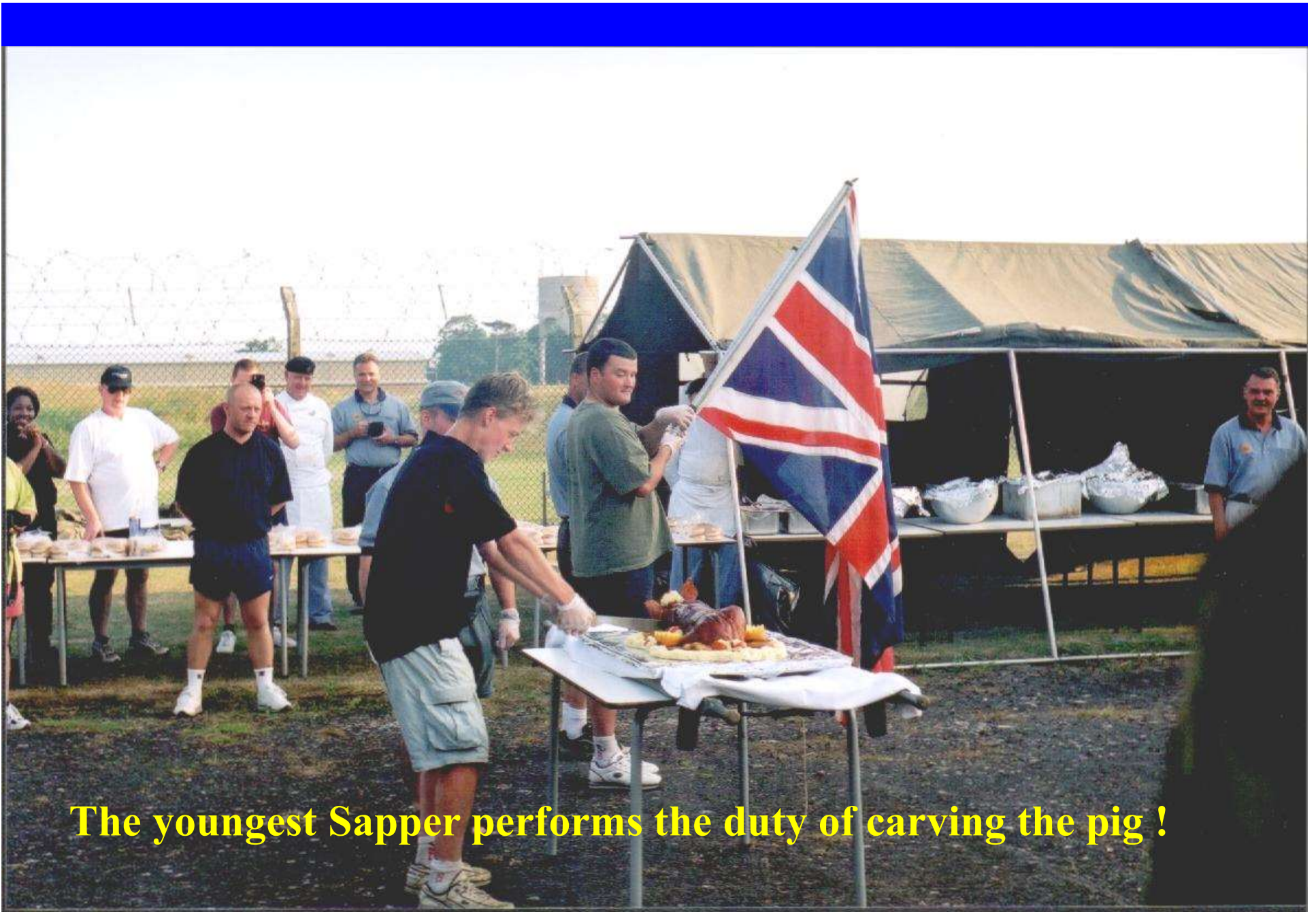
The youngest Sapper performs the duty of carving the pig !