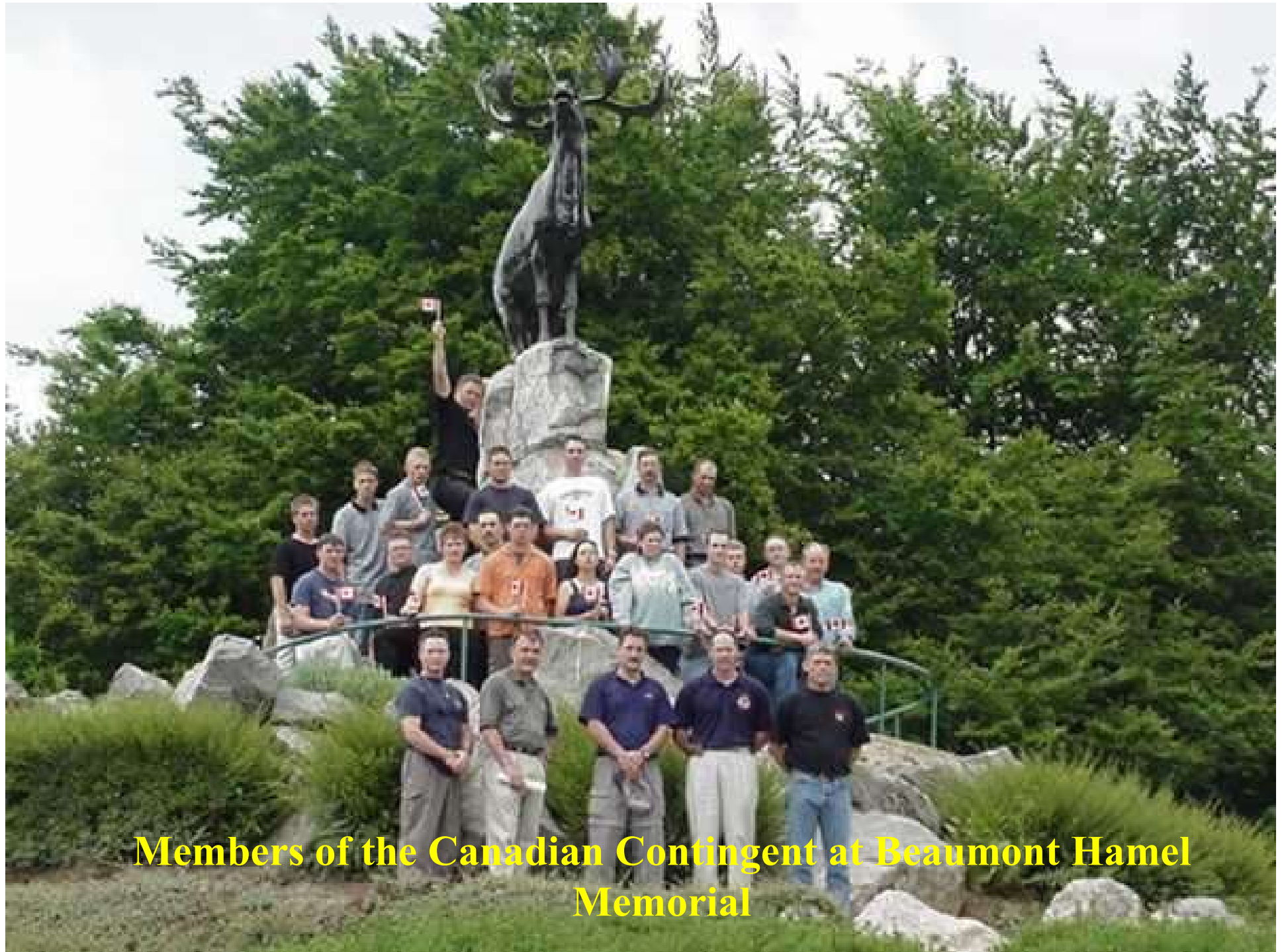
Members of the Canadian Contingent at Beaumont Hamel Memorial