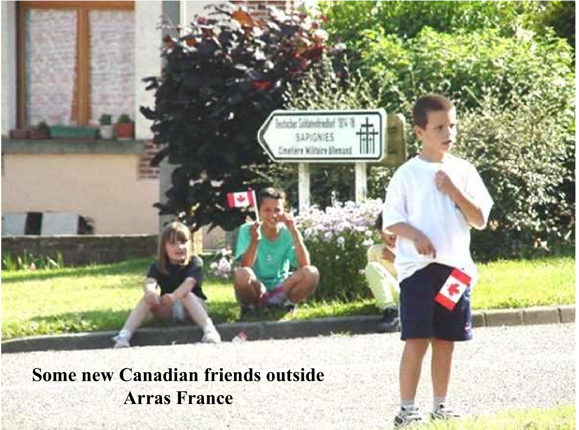
Some new Canadian friends outside Arras France