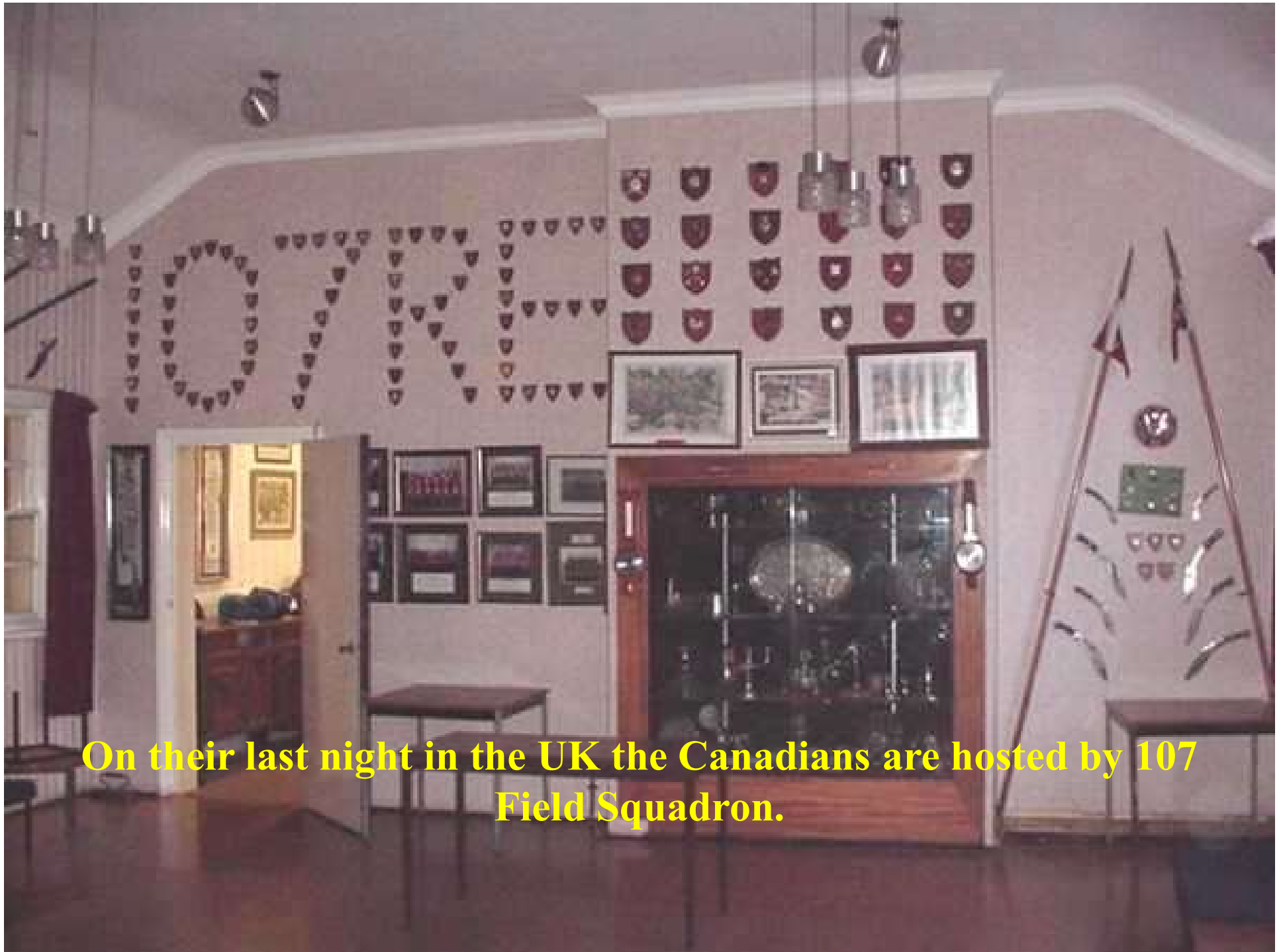
On their last night in the UK the Canadians are hosted by 107 Field Squadron.